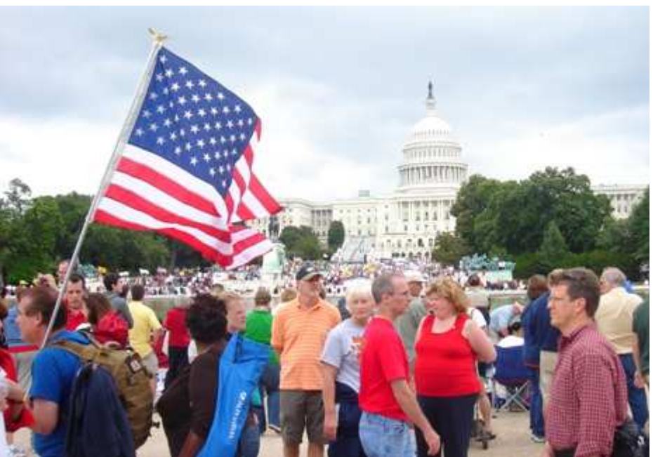
Live at the scene in Washington, D.C.

WND was at the scene to get crowd reaction and take photos of t