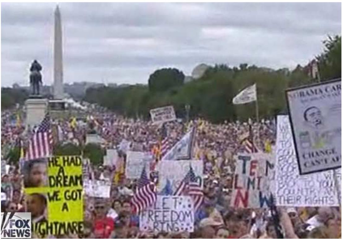
Fox News live footage shows thousands at Capitol

"My grandkids are going to be paying for this. It's going to cost t that we don't have," he said while marching with a wooden cane.